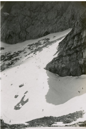
This is the site of the 1945 Great Ski Race at Mt. Mangart.