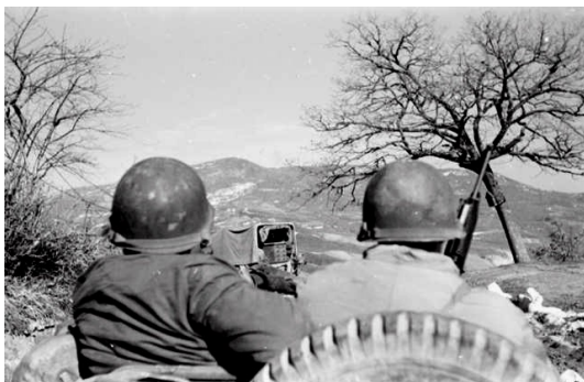
The Germans established a strong defensive position on Mt. Belvedere, shown in the background, and had repelled multiple assaults over an 18 month period.