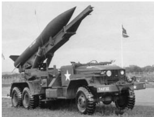
Honest John rocket launcher.

After an extensive training period DIVARTY was ready for its new mission the following summer. On 30 July, 1955 in Wurzburg, Federal Republic of Germany, DIVARTY assumed the mission of its predecessor and took up positions at the center of the American defensive line in Western Europe. DIVARTY's individual battalions took up positions in Aschaffenburg (40 th FA), Schweinfurt (35 th FA), Bamberg (25 th FA and 85 th FA), and Erlangen (43 rd AAA).