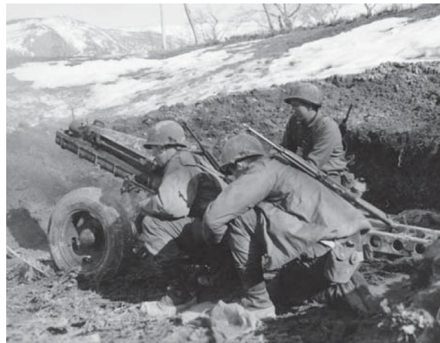
A howitzer crew firing in the Apennine Mountains.

DIVARTY's first month in Italy consisted of pre-combat checks and training, supporting infantry patrols, defensive fires, and enemy harassment. On the night of 18 February, 1945, forward observer (FO) teams from the 605 th FA BN accompanied the Soldiers of the 86 th Mountain Infantry Regiment (MIR) on their assault of Riva Ridge. The following night the 604 th and 616 th FA BNs supported the 85 th and 87 th MIRs during their assault on Mount Belvedere. DIVARTY, with various attached artillery units, continued the fight through the northern Apennine Mountains and into the Po River Valley.