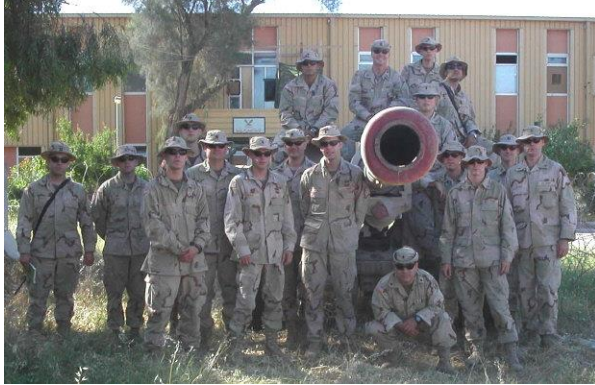
Members of 2-15 FA in Kirkuk, Iraq with a captured Iraqi Artillery piece.

The terrorist attacks on 11 September, 2001 saw DIVARTY Soldiers deployed around the world. In October, 2001 DIVARTY Soldiers first deployed to Uzbekistan in route to Afghanistan, while other Soldiers deployed to Kuwait, Djibouti, Qatar, and Saudi Arabia, in support of Operation Enduring Freedom. DIVARTY Soldiers participated in some of the first battles with Al-Qaida and the Taliban, to include Operation Anaconda.