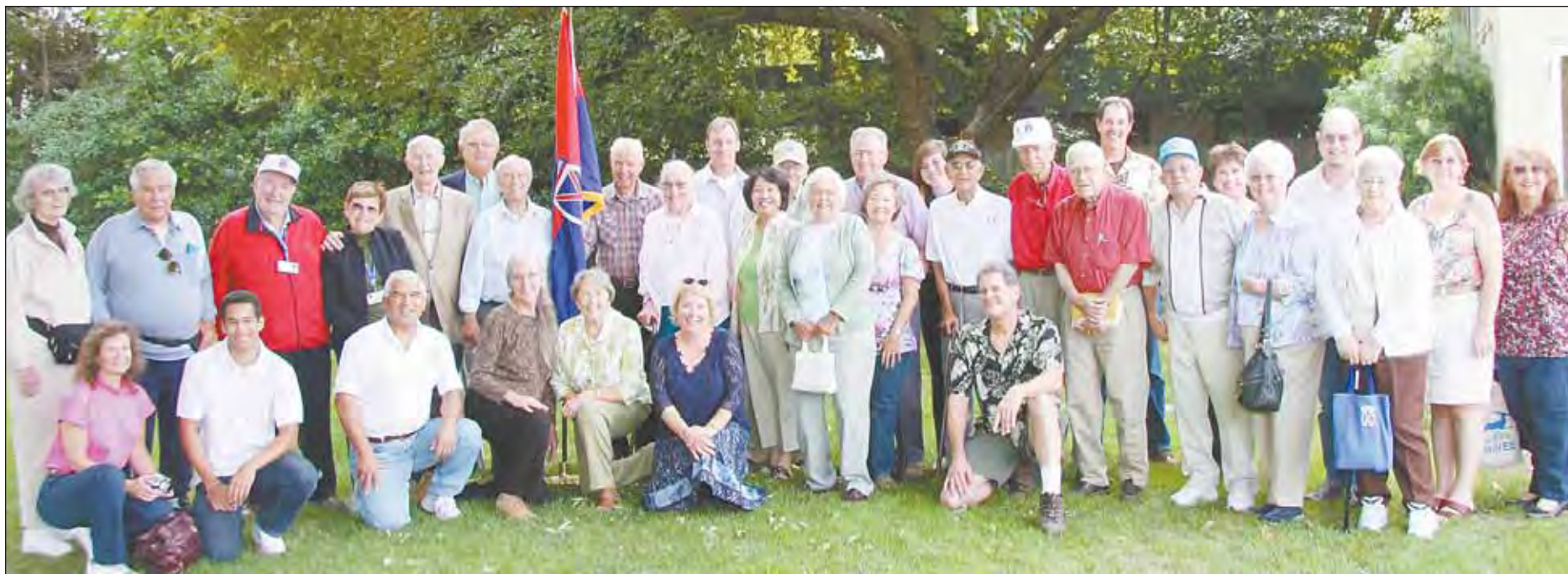
Sierra Nevada Chapter boasts members of all ages with the 10th Mountain Division in common --here at Sacramento gathering.