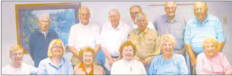
Fall reunion of North Central members at North Branch, Minnesota.