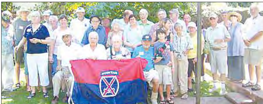
Sunshine bathes veterans, families at annual picnic of Southern California Chapter.

Everything points to an exciting balance of this year. In particular, we mustn't overlook the 10 th Mtn Div platoon we have adopted. Sempre Avanti!