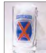
O03 GLASS MUG, $10