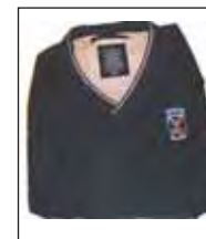
I10 NAVY PULL-OVER WIND-BREAKER, $45