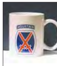
02 COFFEE MUG, $8

WITH CHILLY WINTER DAYS AND NIGHTS UPON US, DISPLAY YOUR PROUD 10TH HERITAGE BY USING THESE 10TH ITEMS. SEE THE COMPLETE QUARTERMASTER CATALOG BY LOGGING ONTO THE 10TH WEBSITE: 10THMTNDIVASSOC.ORG