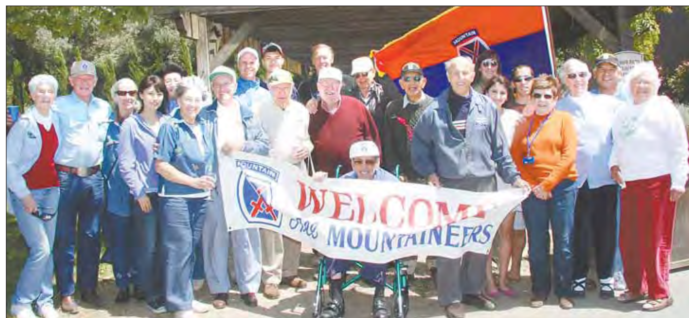
Sierra Nevada Chapter luncheon drew large numbers of veterans, spouses and descendants.

Bob's trip with the Foundation included Tunisia, Italy, Austria, and Germany. Of special import was a visit to a deten-