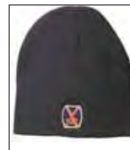
D52 NAVY KNIT SKI CAP, $18