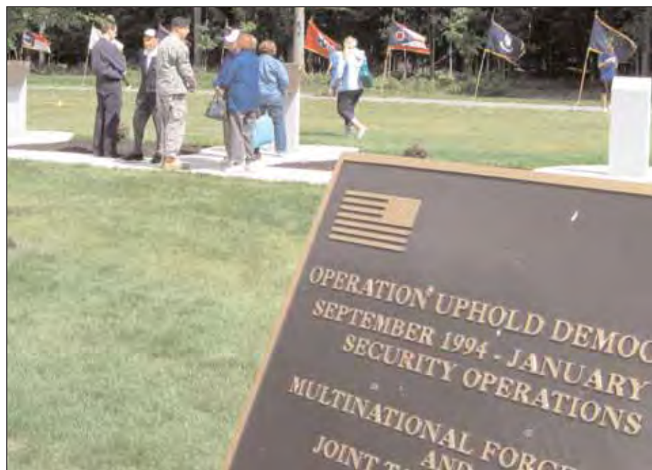
National Reunion ceremony at Ft. Drum gives participants an opportunity to visit bronze plaques contributed by the Association to commemorate recent deployments of the 10th. A stirring rendition of "Taps" (right) was part of the event.