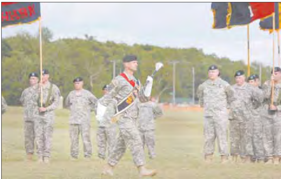
SALUTE TO THE NATION PARADE One of the many highlights of the reunion

See everyone in Washington, D.C., in 2013!